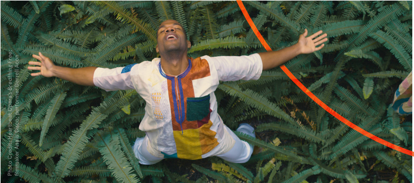
Photo Credit: Heartbeat Opera's Breathing Free , filmmaker Analis Cisco; performer Derrell Acon